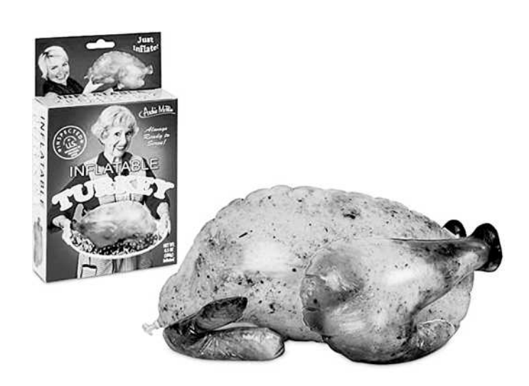
Carving is NOT recommended: This week's second prize.

Submit up to 25 entries at wapo.st/enter-invite-1458 (no capitals in the Web address). Please type each entry without a line break, as above, so the Empress can sort the entries and not go any more bonkers than she already is. Deadline is Monday, Oct. 25; results appear Nov. 14 in print, Nov. 11 online.